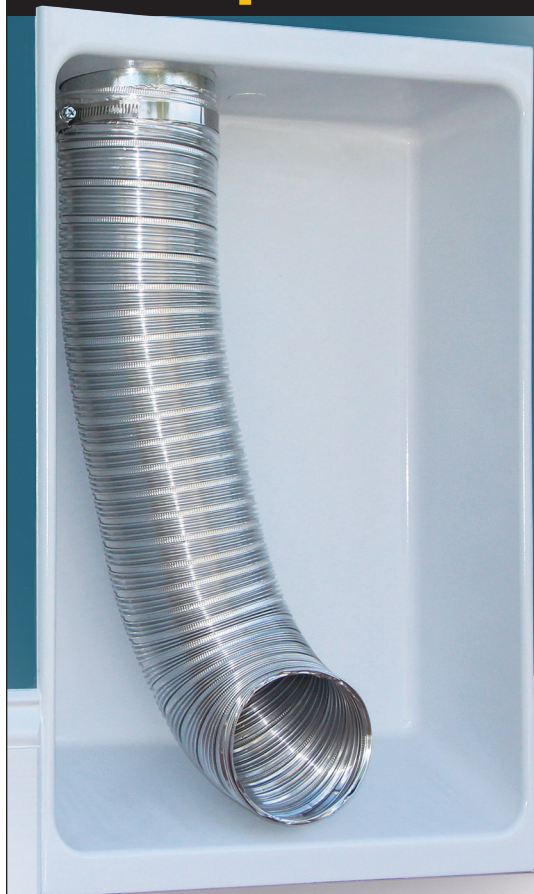
Model 480 — 22 Gauge Aluminized Steel Shown Painted

Protect Transition Hose Neatly in the Wall