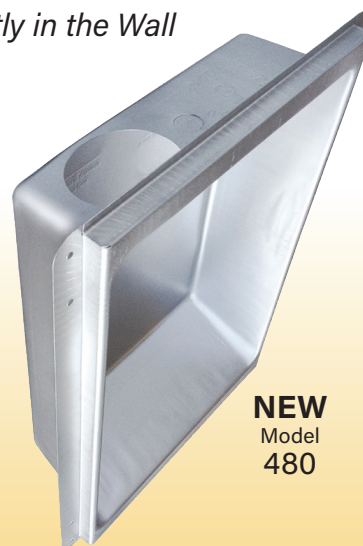
NEW Model 480