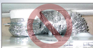
Unprotected Hose is a Fire Hazard