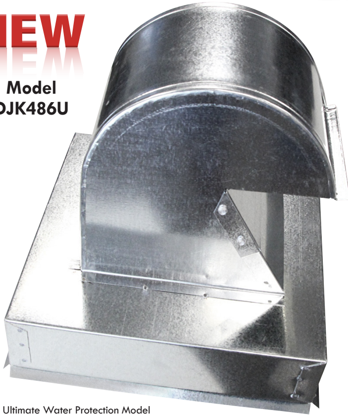
Ultimate Water Protection Model

Laboratory tested to less than 0.01 water column inches of airflow restriction, DryerJacks are efficient. Better airflow performance is achieved through attention to engineering detail including damper curvature, hood size and collar placement.