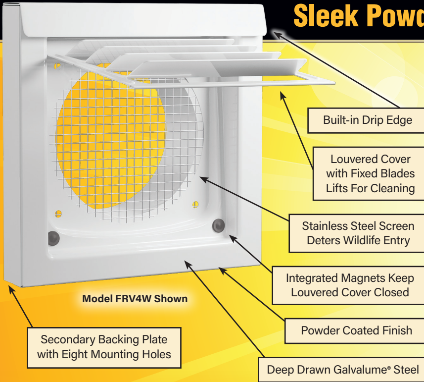
Model FRV4W Shown

Built tough from Galvalume® steel, with a durable powder coating, the FreshVent provides a polished finish that stands up to the test of time.