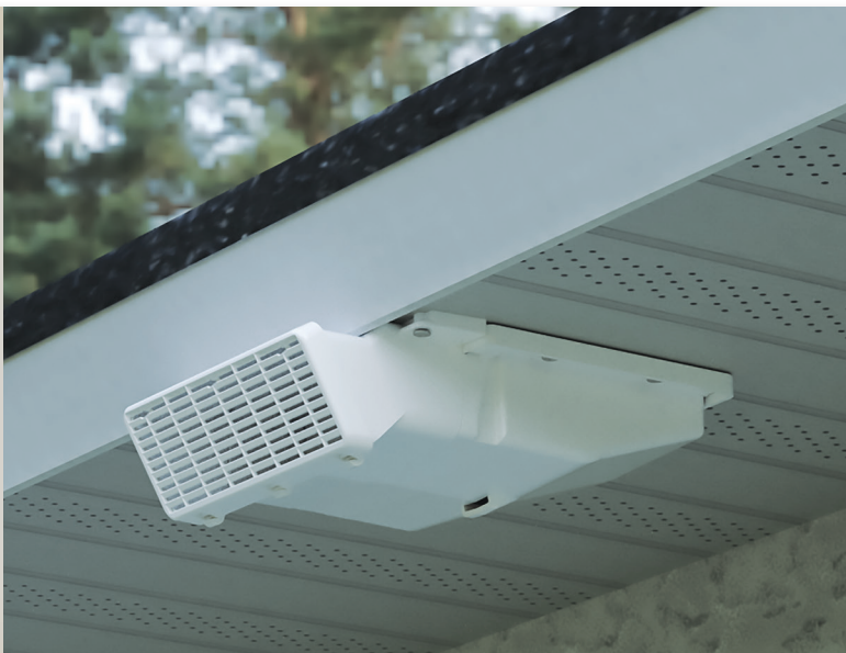
Smart Bathroom Venting Model SFV410

Advanced design features and durable construction make SoffitFlow TM the safer choice for soffit venting. Its smart, removable grill helps prevent pest intrusion. An integrated gravity assisted damper fits tightly to help keep air moving in the right direction. The bottom weep hole lets water from condensation escape to help minimize algae or mold build-up.